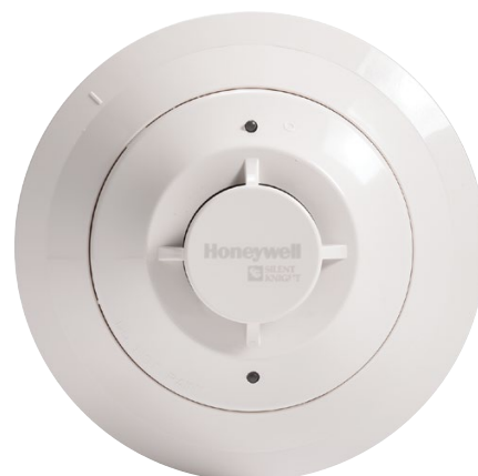
SK-PHOTO (BASE INCLUDED)

The SK-PHOTOR is a remote test capable detector for use with the DNR/DNRW duct smoke detector (not included).